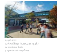
1,100 acres 148 buildings (6,715,482 sq. ft.) 10 residence halls 5 apartment complexes

UB's bustling North Campus, where most of the university's core academic programs are offered, is located in suburban Amherst. Opened in the early 1970s, the North Campus currently has more than 100 buildings and more on the way, including ongoing construction of new apartment-style student housing, as well as state-of-the-art academic buildings.