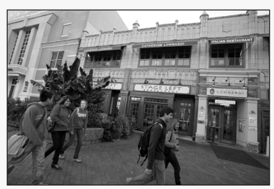
Downtown New Brunswick

Plans are well underway for a successful conference, which will integrate intellectually stimulating panels and visits to special sites and cultural events. The recently renovated Hyatt New Brunswick boasts a central location, as it is in walking distance from Rutgers University, the Zimmerli Museum, the train station, restaurants, and shops. For the Convention, the Hyatt will give NeMLA members a very favorable rate. New Brunswick is easily accessible from Newark Airport and is only a short train ride to New York City.