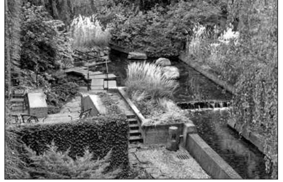
Hilton Bonaventure Rooftop

For current availability and rates, check the NeMLA website: http://www.nemla.org/convention/hotel.html