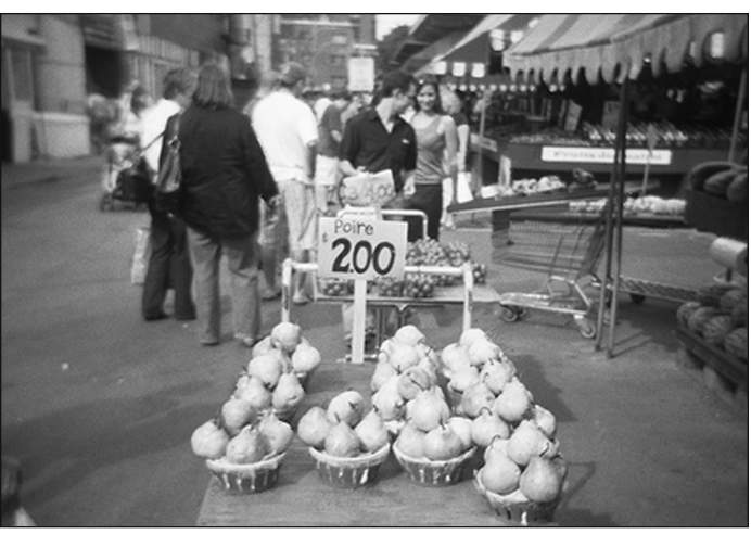
Pears at market

Time : Wednesday to Friday 11-5 (Permanent Exhibit) and 11-9 (Tiffany Exhibit); Saturday and Sunday 10-5. Cost : $7.50-15