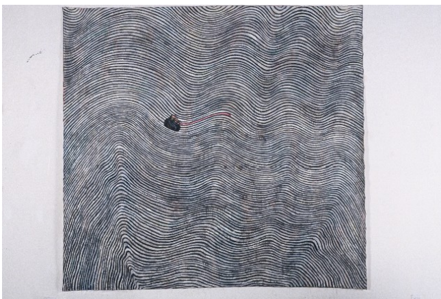
Crossing, 1999 Acrylic, charcoal, shellac on canvas 112" x 120" Collection of Museo Jaurequia, Navarra, Spain