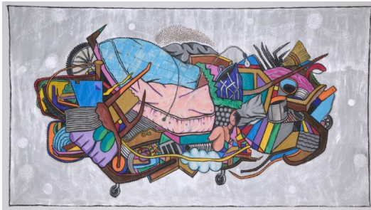
Cart (Homeless), 2008 Acrylic, charcoal, enamel, shellac on canvas 96" x 174"