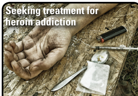
Seeking treatment for heroin addiction

Treatment for heroin addiction tends to be more effective when the heroin use is identified early, before the physical addiction has been able to take hold.