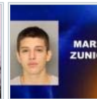
Teen Involved In Crash With Roy Barnes Daughter Has Died 3 weeks ago