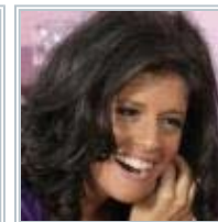
Cancer Activist's Approach A Bit Irreverent 3 weeks ago