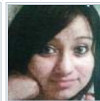
Nationwide Alert Issued For Missing Morrow Teen 2 weeks ago