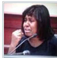
Cracker Barrel Beating Sentence Outrages Victim, Community 2 weeks ago