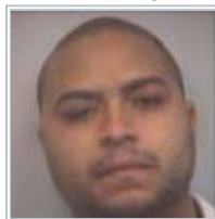
Newlywed Husband Charged With Wife's Murder 1 day ago