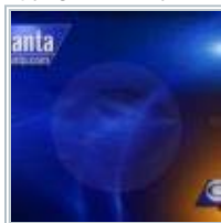
Bibb County Ga. Deputy Shoots Pit Bull New Today!

Copyright 2010 by cbsatlanta.com. All rights reserved. This material may not be published, broadcast, rewritten or redistributed.