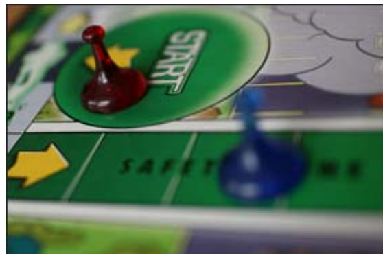
Age-old board games incorporating numbers and counting have led to better understanding of numbers by young students, research shows.