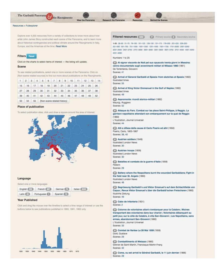
Image 2 A full view of The Garibaldi Panorama Explorer (GPE) showing all the available resources, facets, and filters that allow to sort the information in the GPE database.

https://library.brown.edu/cds/garibaldi/resources/fullexplorer.php