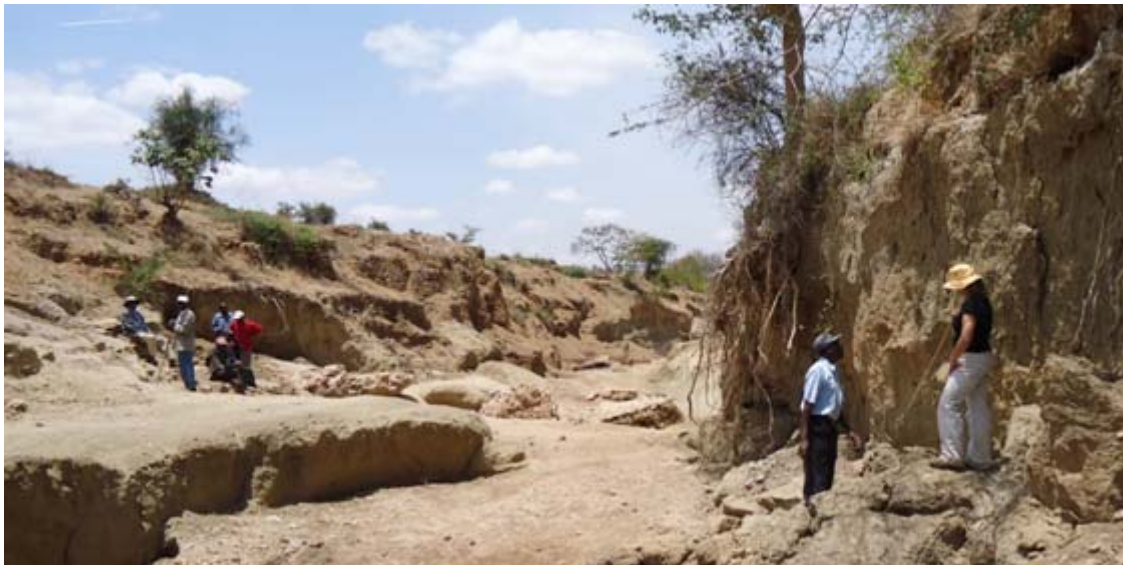
During the rainy season, this ravine fills with water and becomes impassable.