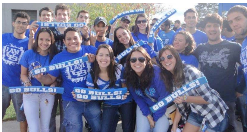
Brazilians love their football!