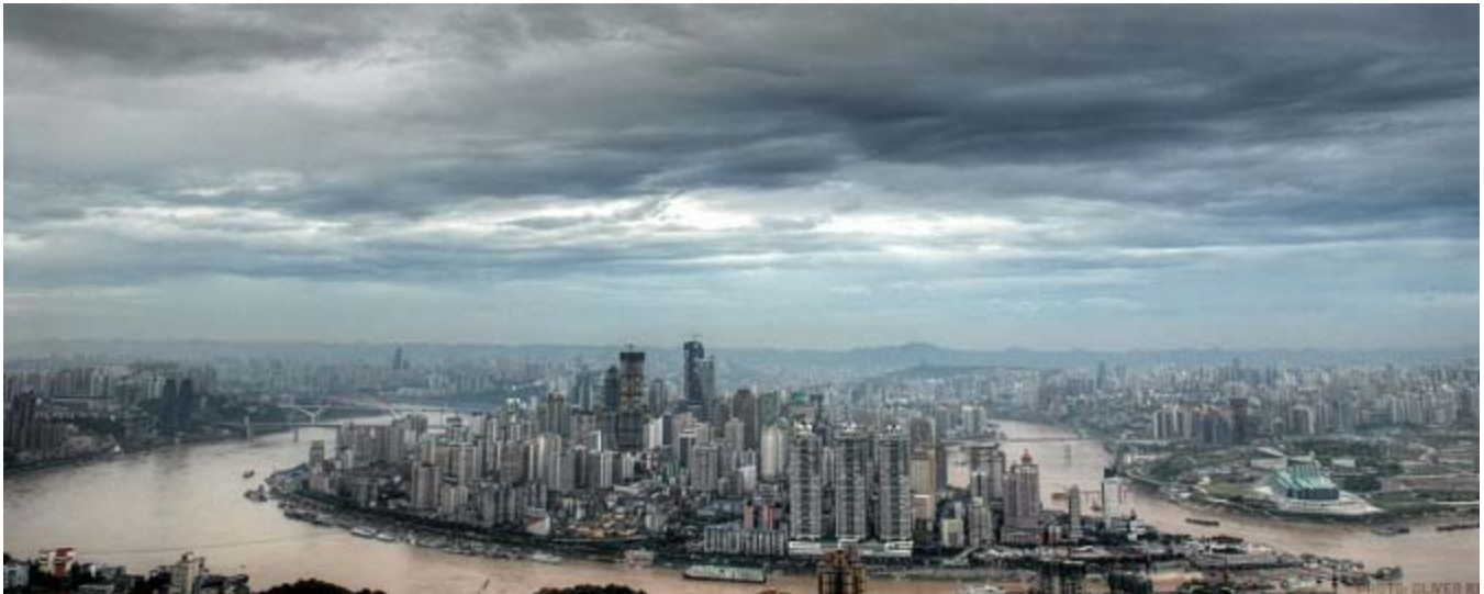
China's megacities like Chongqing illustrate the challenges of urban hyper-development

Today, more than half of China's residents live in cities, compared to only 20 percent in 1979. There are over 160 cities in China with one million or more residents, and five "mega cities" with over 10 million inhabitants.