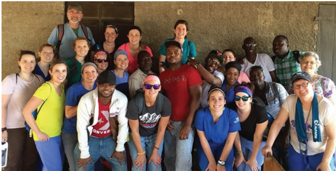
UB Nursing students with local collaborators in Haiti