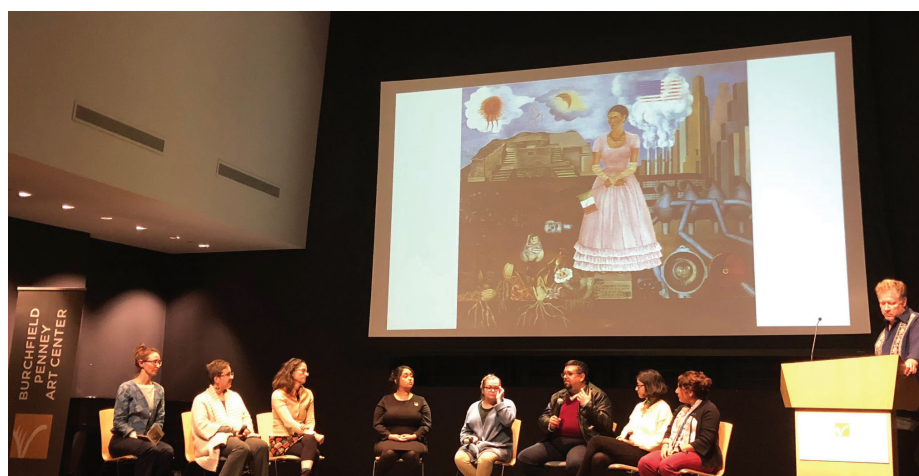
The Global Film Series featured a panel on migration and immigration

that provide a better understanding of our globalized networked world.