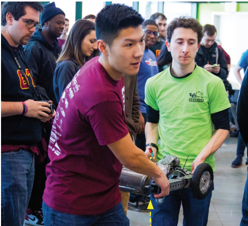
Robot Wars •----- During Engineers Week, the battles are real—and so is the problem-solving. Putting ideas to the test doesn't get much more fun than this.