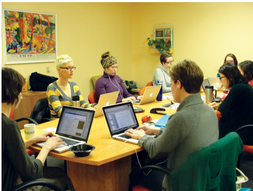
Participants in the writing workshop this spring in our newly renovated space