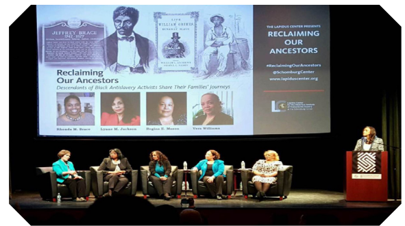
Schomburg Center, New York Public Library Lapidus Center for the Historical Analysis of Transatlantic Slavery

"Reclaiming Our Ancestors" is forging a powerful public history network of scholars and activists.