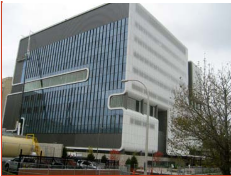
CTRC Exterior. Photograph taken October 21, 2011.

Casework for the incubator labs on the 5th floor and the CTRC laboratories on the 6th floor will be delivered soon. Installation of the wood paneling for the wall of the open atrium which extends from the 5th floor to the roof will begin in November. Construction continues with an anticipated occupancy of early May 2012.