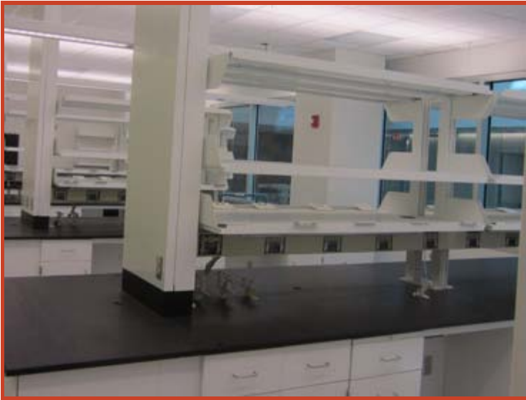
Sixth Floor: Completed Laboratory

The CTRC is ready for the installation of equipment and furniture which will take place over the next two months or so. It is anticipated that research groups will move into the building during the months of July and August.