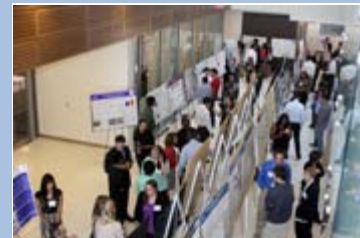
Poster session in the CTRC atrium at Student Research Day.

See this link to see the 6 programs and more details on a most successful event.