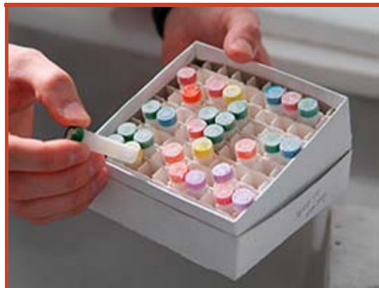
Supported by a combination of funds from