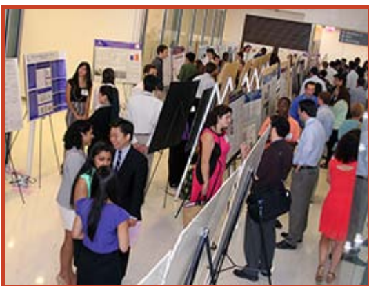
Photo: Research Day in the Clinical and

the Clinical and Translational Science Award (CTSA) and institutional support, the CTSA has awarded 7 teams of researchers pilot studies to support innovative clinical and translational research projects.