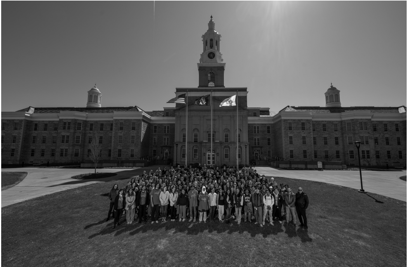
Students, faculty and staff of the School of Architecture and Planning gather in front of our historic home in Hayes Hall on UB's South Campus. The event kicked off Atelier 2023, a weeklong celebration of the work and culture of our School and a cherished tradition dating back more than 30 years.