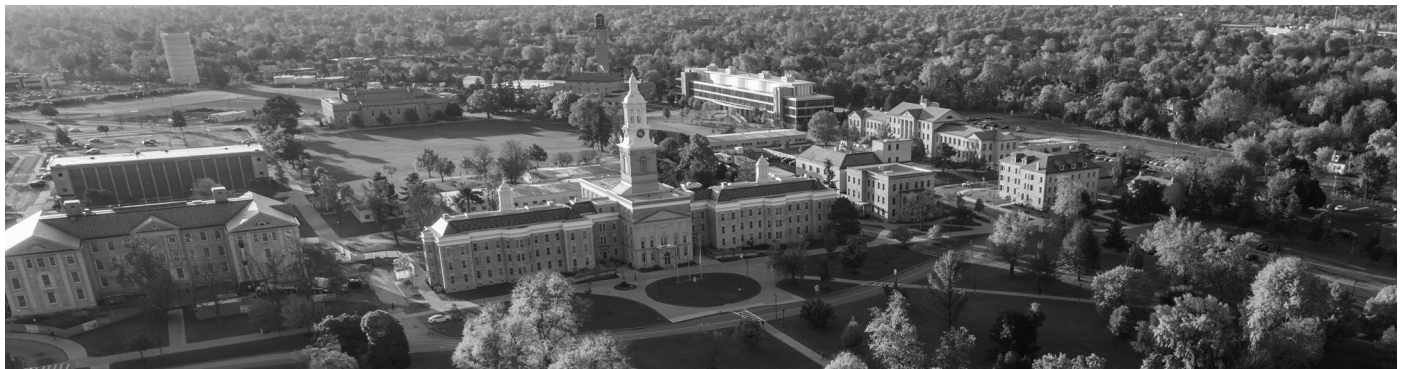
Aerial view of the School of Architecture and Planning's historic home on UB's South Campus.