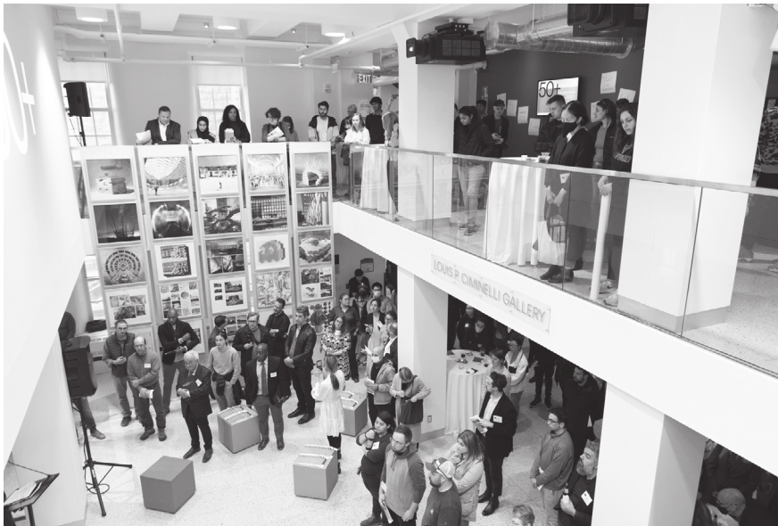
Photos from the 50+ Anniversary Celebration

As we take stock of the trajectory of our first 50 years, we ask, “Where to from here?” Today is a moment of great possibility - for our School, for the University at Buffalo, and for our professions. As we act with bold ambition and renewed urgency on the complex challenges facing cities today, we imagine what's possible when we work together. We invite you to be part of the conversation as we advance our collective mission to create a more equitable, resilient and vibrant built environment for all: archplan.buffalo.edu/PlusYou