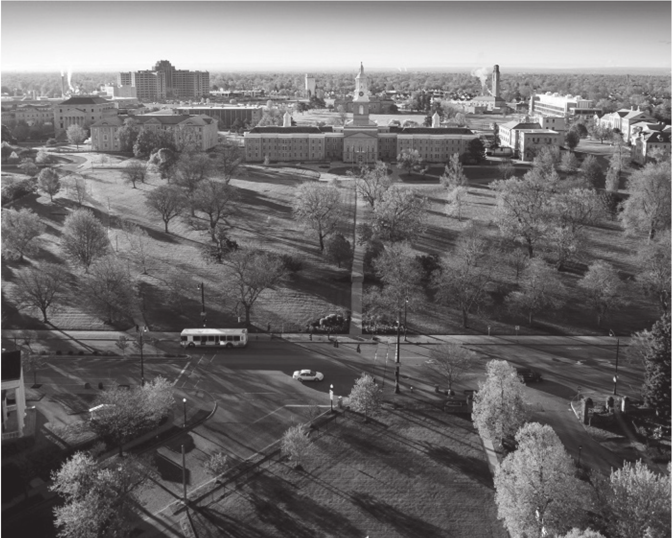
A view of Hayes Hall and UB's historic South Campus, home to the School of Architecture and Planning.