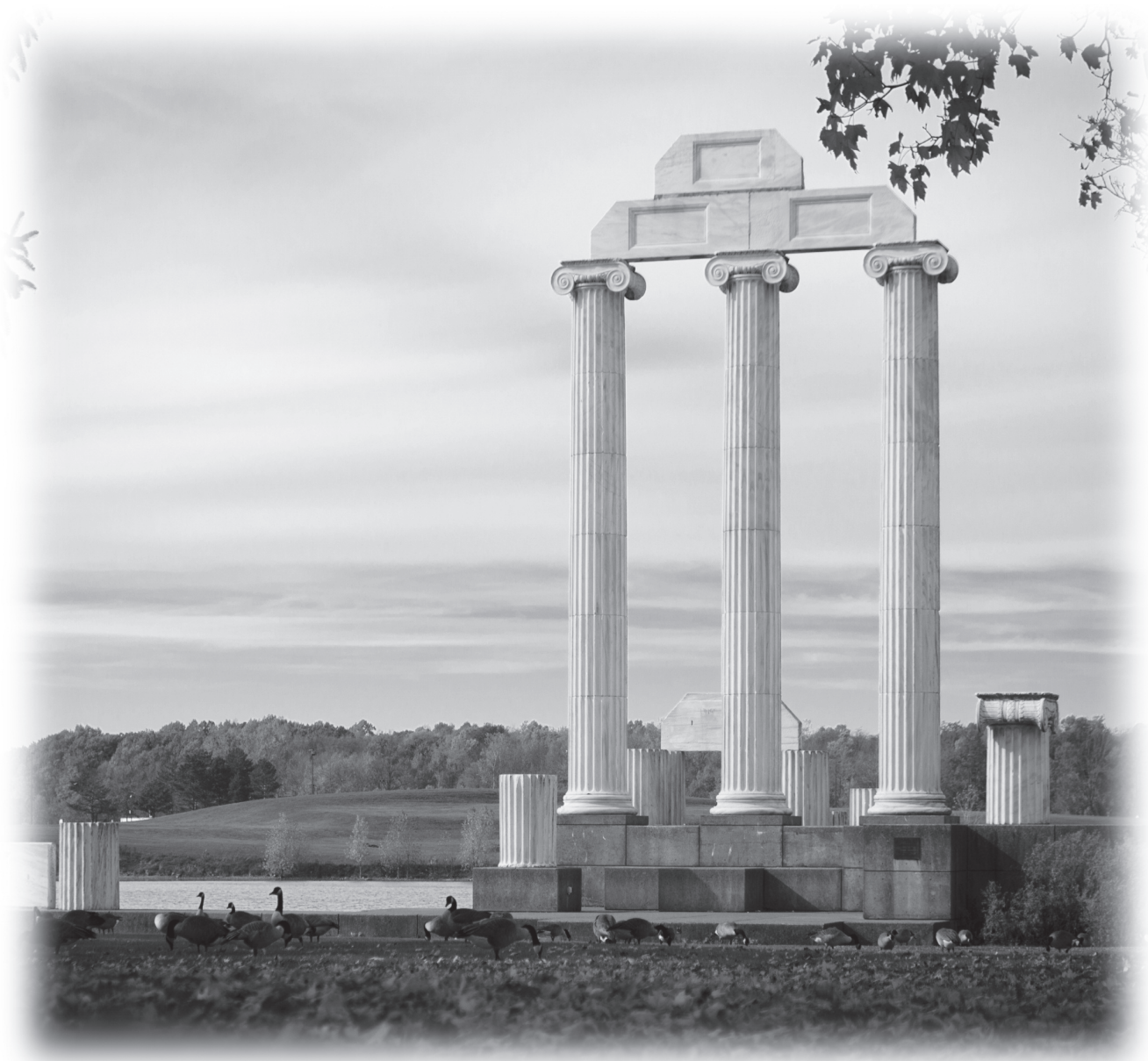
Baird Point is an outdoor, Greek-style amphitheater located on the southern shore of Lake LaSalle. It was a gift to the University from the Baird Foundation and the Cameron Baird Foundation. The marble columns on the concrete platforms were once part of the old Federal Reserve Bank in downtown Buffalo. Following their relocation to the lake, the columns were dedicated as a memorial to servicemen and servicewomen.