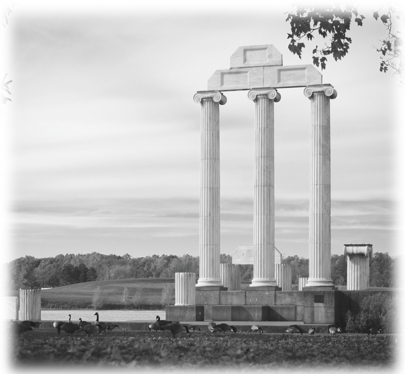
Baird Point is an outdoor, Greek-style amphitheater located on the southern shore of Lake LaSalle. It was a gift to the University from the Baird Foundation and the Cameron Baird Foundation. The marble columns on the concrete platforms were once part of the old Federal Reserve Bank in downtown Buffalo. Following their relocation to the lake, the columns were dedicated as a memorial to servicemen and servicewomen.