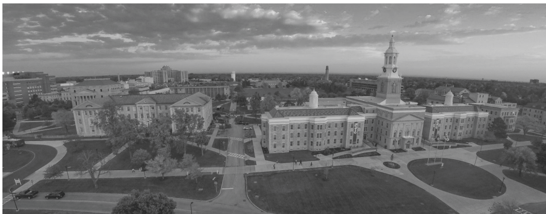
Hayes and Crosby Halls on UB's South Campus.