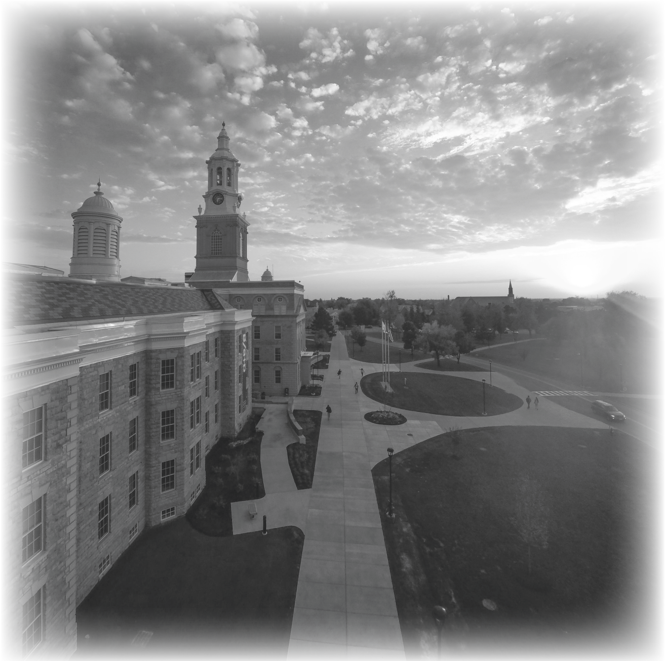
Hayes Hall, the School of Architecture and Planning's historic home on UB's South Campus.