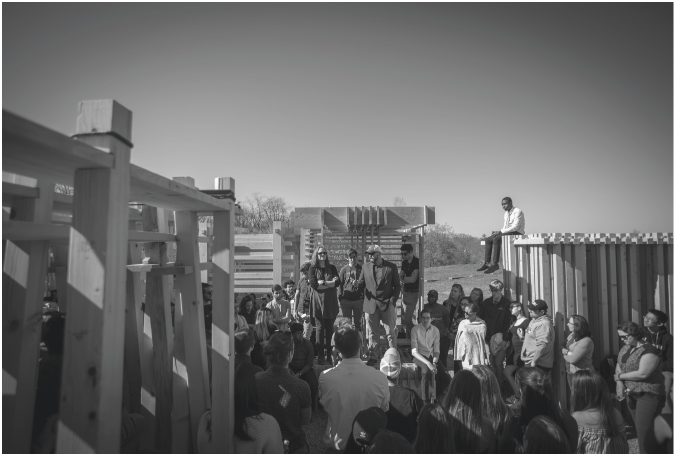
Members of our Class of 2021, as freshman architecture students, with their first-year studio design-build projects in 2018. The wooden structures remain on display at Artpark in Lewiston, N.Y.

Together, we're imagining - and building - a better world.