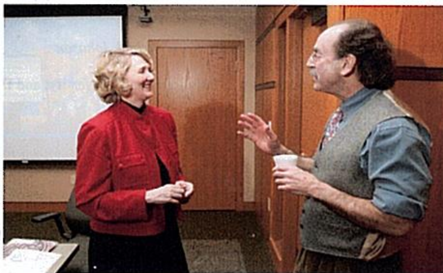
Baldy Center Multidisciplinary Symposium