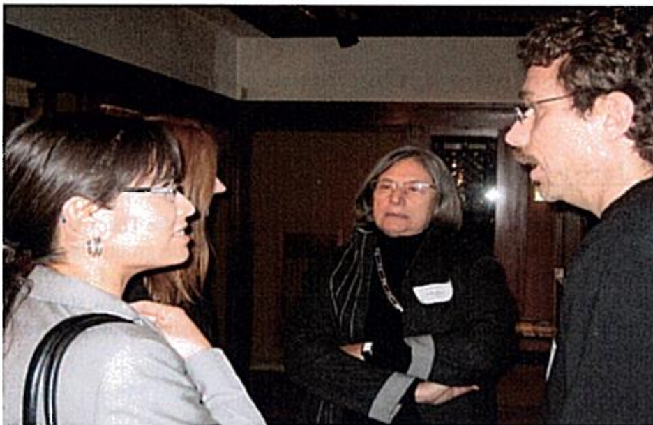
Baldy Center Annual Retreat 2008