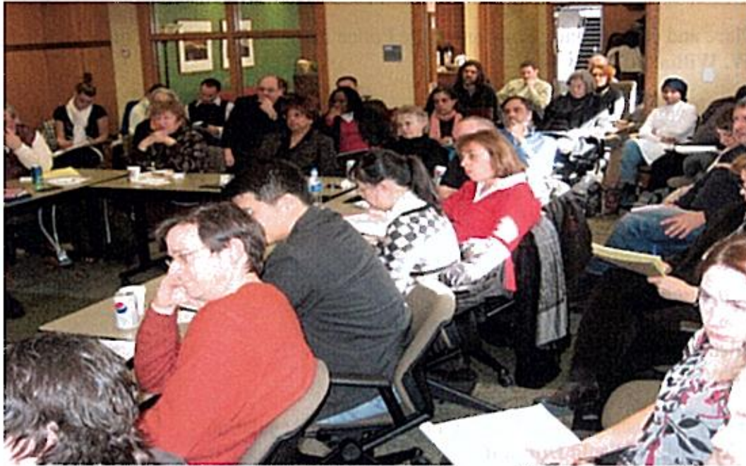
Baldy Center Workshop on Law, Place, and Space