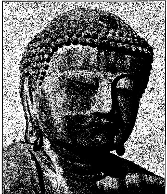
Buddha, Kamakura, Japan