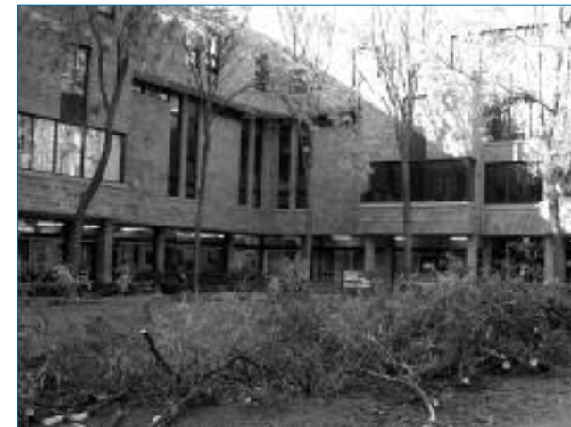
Department of Geography courtyard