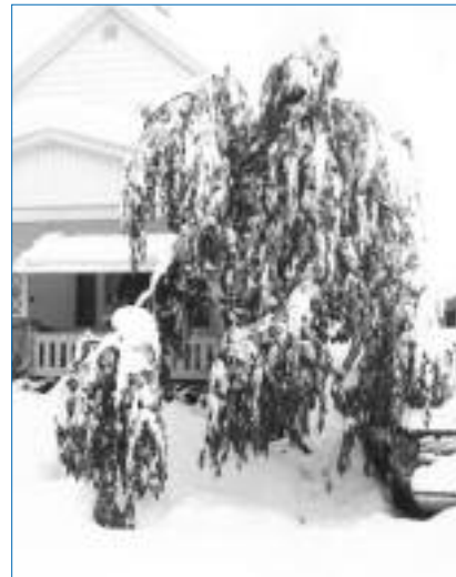
Weeping Cherry (his name in Don ... Don Cherry for all you Canadian hockey fans!)

The next morning, the sky was a beautiful cotton candy pink and blue. I grabbed my camera and hiked through two feet of snow in the driveway to check on the trees. Each of our two trees only lost one branch. Other trees, mostly maples that lined our street, were not so lucky.