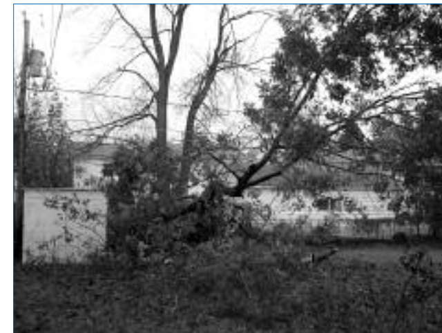
After the storm