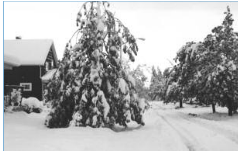
A view down the street.