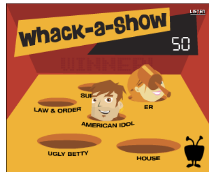
Advertise on NYTimes.com