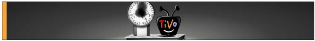
Advertise on NYTimes.com