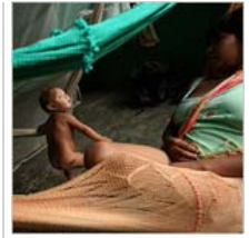
Tribe's Charge of Neglect Is Shrouded by Politics

Home | World | U.S. | N.Y. / Region | Business | Technology | Science | Health | Sports | Opinion | Arts | Style | Travel | Jobs | Real Estate | Automobiles | Back to Top Copyright 2008 The Associated Press | Privacy Policy | Search | Corrections | RSS | First Look | Help | Contact Us | Work for Us | Site Map