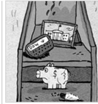
Op-Ed: Questions for the Presidential Candidates