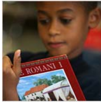
A Dead Language That's Very Much Alive