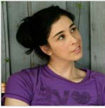
Message to Your Grandma: Vote Obama