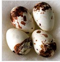
Audubon's Species: Bird Art, in All Its Glory

California's latest initiative on climate change will help reduce emissions. There will be more progress if others follow.