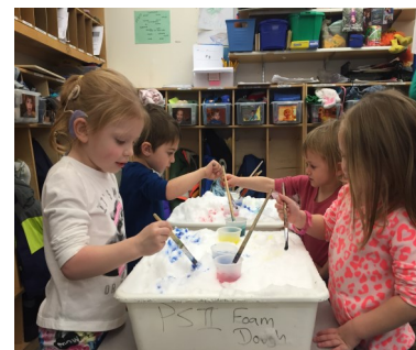
Painting activity in preschool.

Both UBCCC and the EARS preschoolers look forward to this unique and rewarding learning experience.