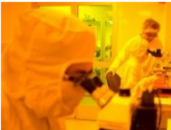
DAVIS HALL ELECTRICAL ENGINEERING CLEANROOM

Among the most advanced in the Buffalo Niagara region, this facility features seven bays of class 1000 space with class 100 working areas, allowing for electronic device research, processing and development, including study and fabrication of nano-devices.