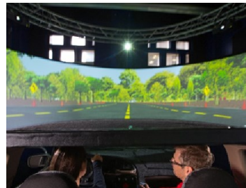
FURNAS HALL MOTION SIMULATION LAB

The Materials Characterization Lab facilitates cost-effective analysis and characterization of a wide range of materials. Four research bays and 1,700 square feet of space, house the resources needed to analyze liquid, powder, surface and bulk materials.