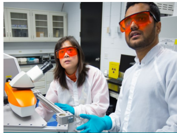
FURNAS HALL MATERIALS CHARACTERIZATION LAB

Among the most advanced in the Buffalo Niagara region, this facility features seven bays of class 1000 space with class 100 working areas, allowing for electronic device research, processing and development, including study and fabrication of nano-devices.