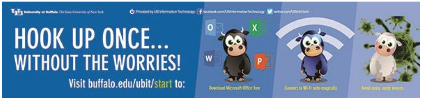
Stampede bus headliner

26) How did you find out that UB offers free software like MS Office and Symantec Endpoint Protection anti-virus and firewall? (Select all that apply.)