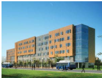
Cannon Design created the South Ellicott Housing building at the University at Buffalo's South Campus.

The University at Buffalo, a flagship institution of the State University of New York system, has embarked on a $360-million capital improvement program designed to prepare the school to serve more than 38,000 students by 2020.