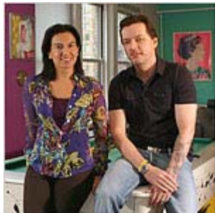
They're Mad, Bad, and They Sell Accent Pieces