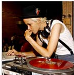
Setting the Beat, and the Style