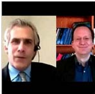
Bloggingheads Video: Annapolis Enigma