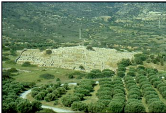
The ancient town of Gournia.