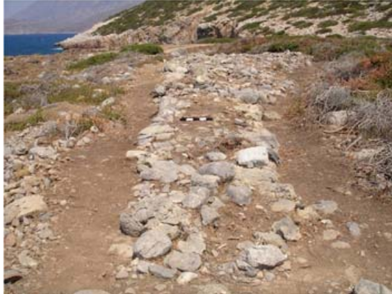
The remains of one of the coastal fortification walls.

In addition to the beach fortifications, it also appears that the Minoans built a second line of defence a little bit inland. Heading south, away from the beach, there were two walls, together running about 180 meters east to west. Backed by a tower, or bastion, they encompassed natural features such as a hedge. The walls would have posed a formidable challenge to any invader trying to march south towards the town.