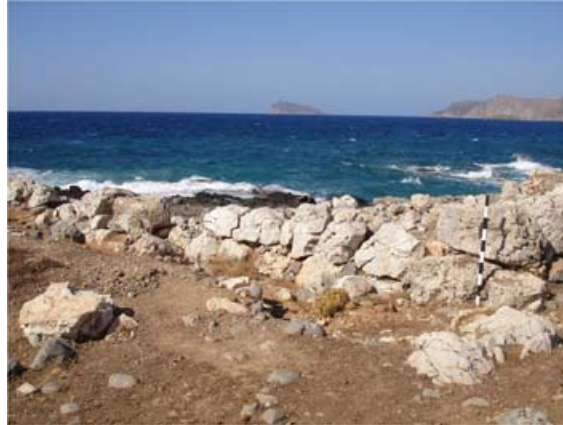
Image of the shipshed, west facade.