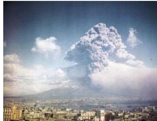
Vesuvius last awoke with a small blast in 1944. A large eruption could unleash incendiary avalanches and ash that would threaten millions of people.