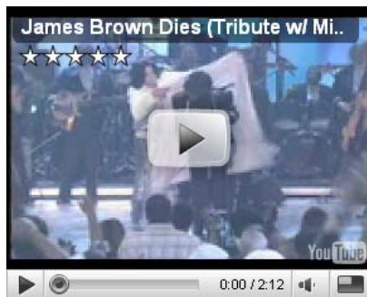
Jackson 5: 'I want you back'