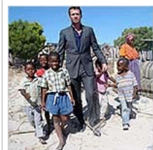
How a Very Rich Man Grows a Conscience