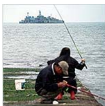
In Clash Between Koreans, Fishermen Feel First Bite