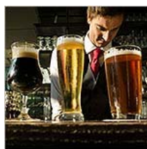
A Beer, Please, and a (Good) Menu