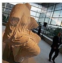
Elgin Marble Argument in a New Light