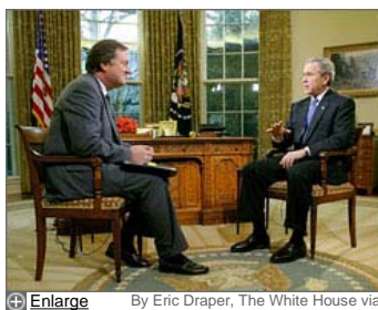
President Bush is interviewed by Tim Russert, left, during an Oval Office pre-taping of 'Meet the Press' in Feb. 2004. This was the first network television interview of Bush after his victory in the 2000 election.