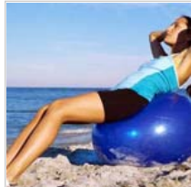
Instant Ab Flatteners