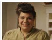
Living Large and Loving It

- WEDNESDAY, July 22 (HealthDay News) -- When it comes to weight control, it might not be the kind of snack that matters, but who eats it.