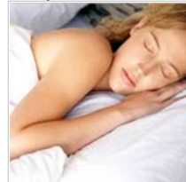
Tips for Better Sleep