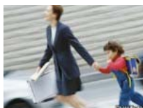
Scholarships available for parents going back to school

Clips from it have been featured worldwide -- on CNN, MSNBC, the Drudge Report, Rush Limbaugh's radio talk show -- and catapulted the woman into the unlikely role as a spokeswoman for the "birther" movement, whose members question whether Obama is a native-born American and eligible to serve as president.