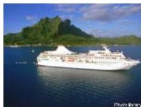
The Secret to Getting Highly Discounted Cruise Tickets