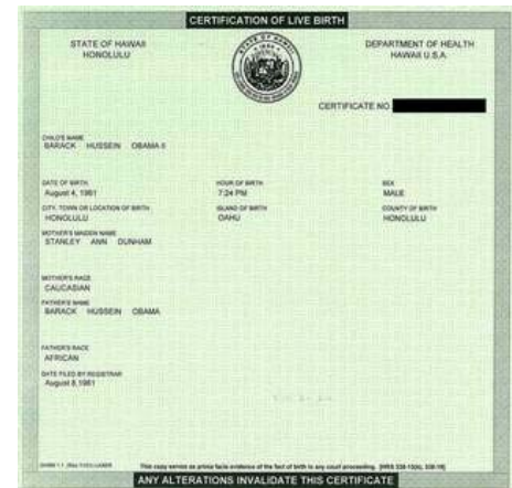
The official certification of live birth of Barack Hussein Obama provided by the State of Hawaii.