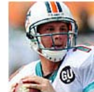
Past 10 Comeback Players of the Year