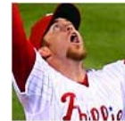
Best Games of 2008