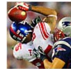
SI's Greatest Shots of '08