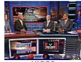
VIDEO Turner Gill (75)