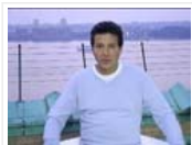
Living Well: Diaphragmatic Breathing

NEW YORK (Reuters Health) - When asthma and symptoms of depression coexist in kids, asthma may become worse, study findings suggest.