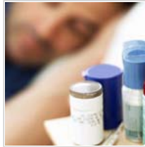
Cold or Flu?