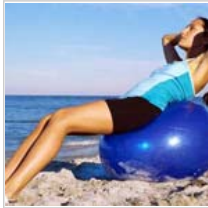
Instant Ab Flatteners