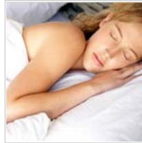
Tips for Better Sleep