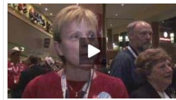
Delegates' reaction: Bush, Gustav, teen pregnancy Wednesday, September 3