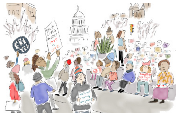
Live Drawing The 2019 Women's March In Washington DC by Liza Donnelly, http://lizadonnelly.com