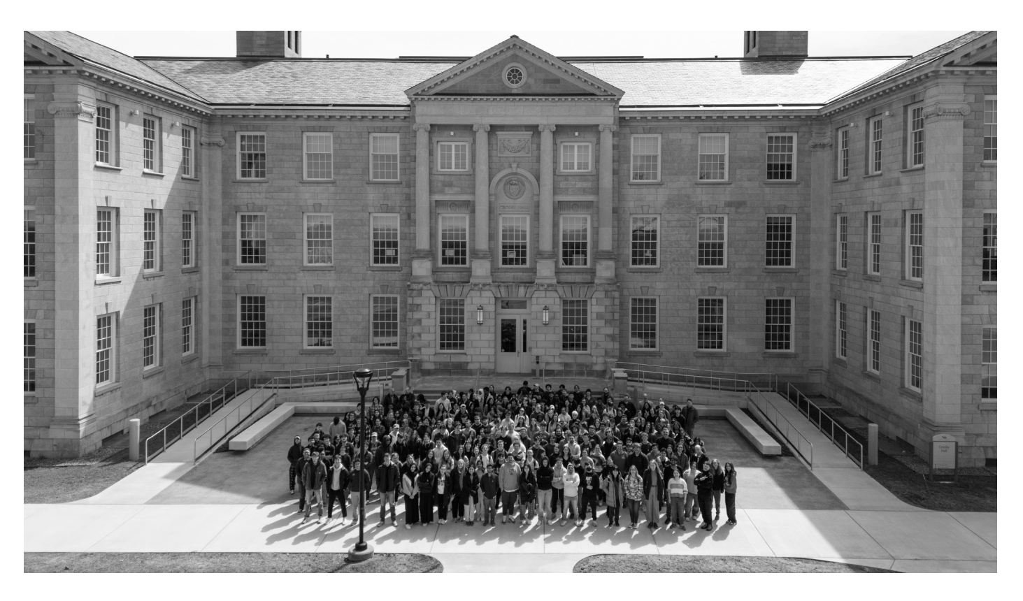
Students, faculty and staff of the School of Architecture and Planning gather in front of the renewed Crosby Hall on UB's South Campus, where classes resumed in spring 2024 following a 2.5-year full restoration. The event kicked off Atelier 2024, a week-long celebration of the work and culture of our school and a cherished tradition dating back more than 30 years. Photo: April 1, 2024, by Douglas Levere, BA '89.