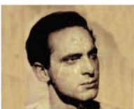
Pietro di Donato

Richard Wright, Native Son (1940): the experience of African American “immigrants” to Chicago from the Deep South: slumlife, crime, racism, poverty, and the quest for ideological understanding.