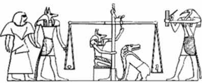
Egyptian weighing of the soul

Satisfies an Early Literature Requirement