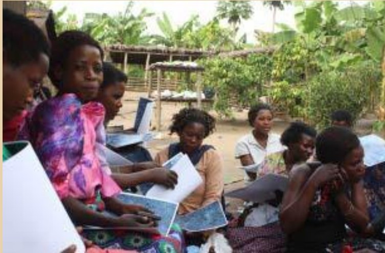
A group of widows working with GIS mapping in Uganda.