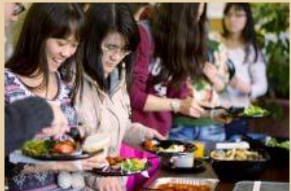
Enjoying the reception!