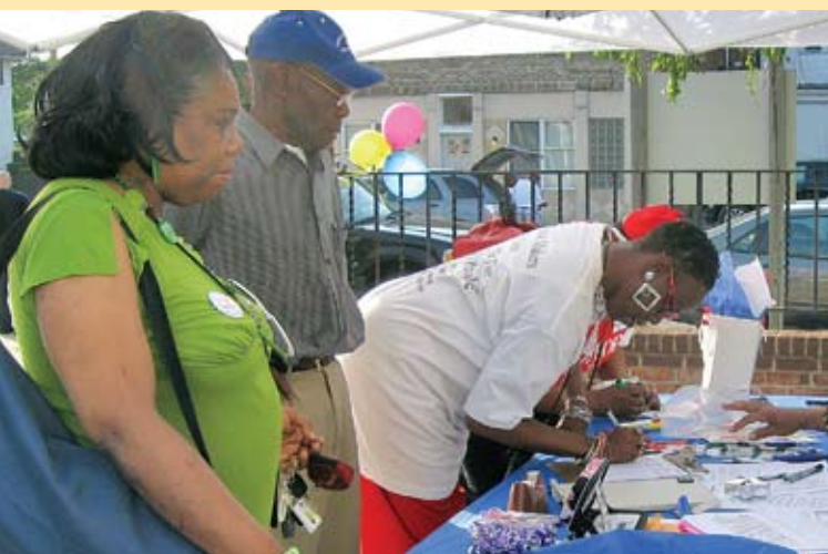
Guests at the University District Block Club Coalition's first-anniversary celebration filled out surveys about their block clubs.